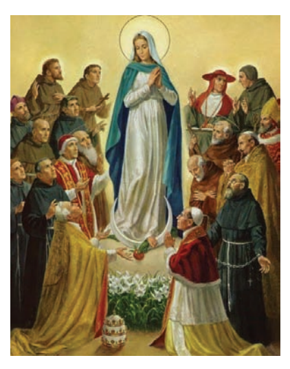
Queen of all Saints Pray for us!